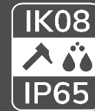
Robust & Secure